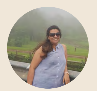
27Augusi Hetal Sangoi